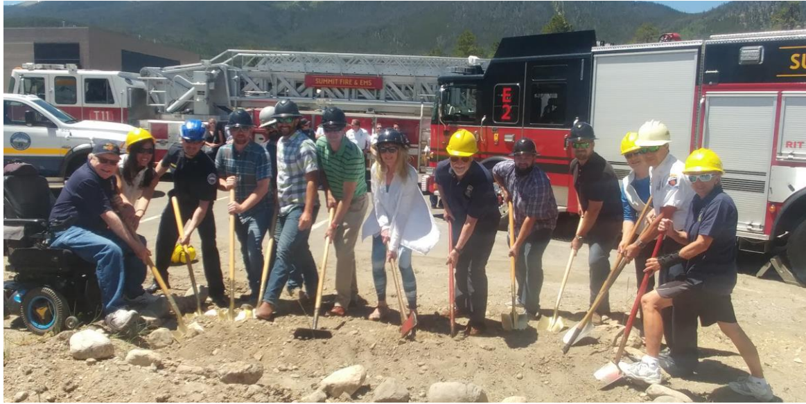
Groundbreaking on the new $4.2 million administration building in the Summit County Commons near Frisco, to be shared with the Summit County Ambulance Service, occurred on June 29.