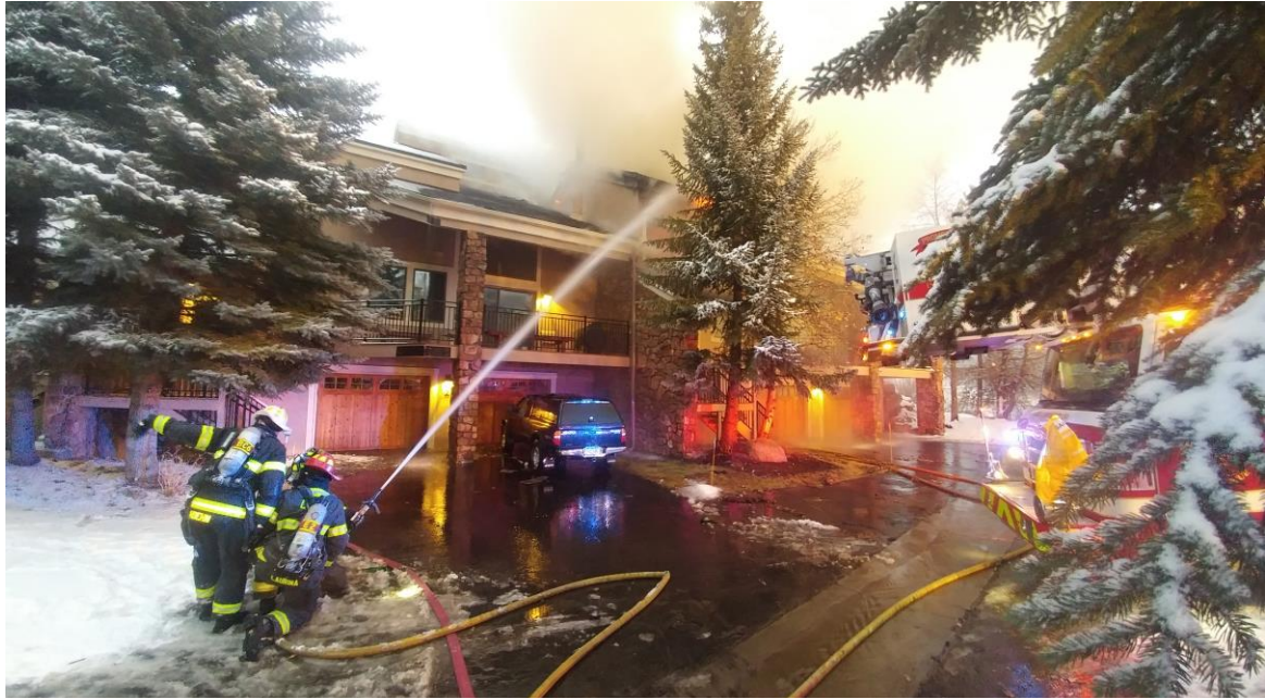
Summit Fire firefighters battled the tenacious Enclave condominium fire in Keystone on November 23.